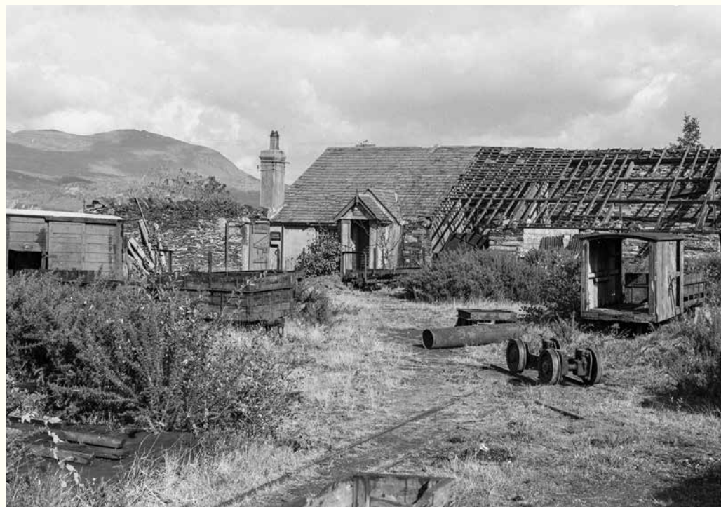
Boston Lodge Top Yard in 1957.

The project will involve the restoration, repair or re-creation of a number of Grade II listed buildings across the Boston Lodge site, with major attention being focused on the historic Top Yard, the area seen in the photographs in this leaflet. The work will ensure the future of these buildings whilst at the same time ensuring that they are of practical use within the context of a very active engineering works. It is also planned that volunteers will lead a sub-project to construct a locomotive shed